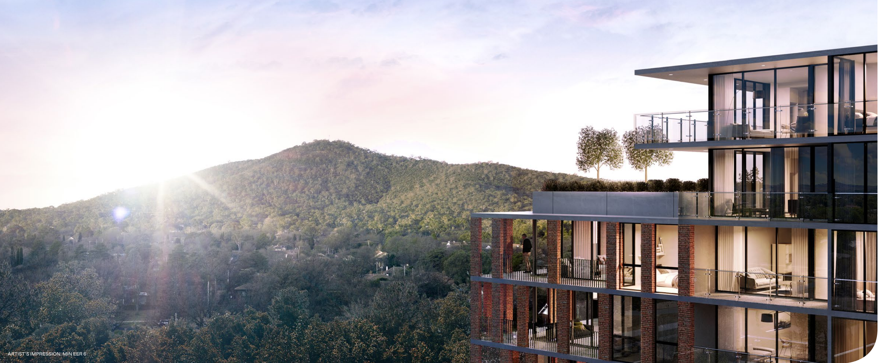
ARTIST'S IMPRESSION: MIN EER 6