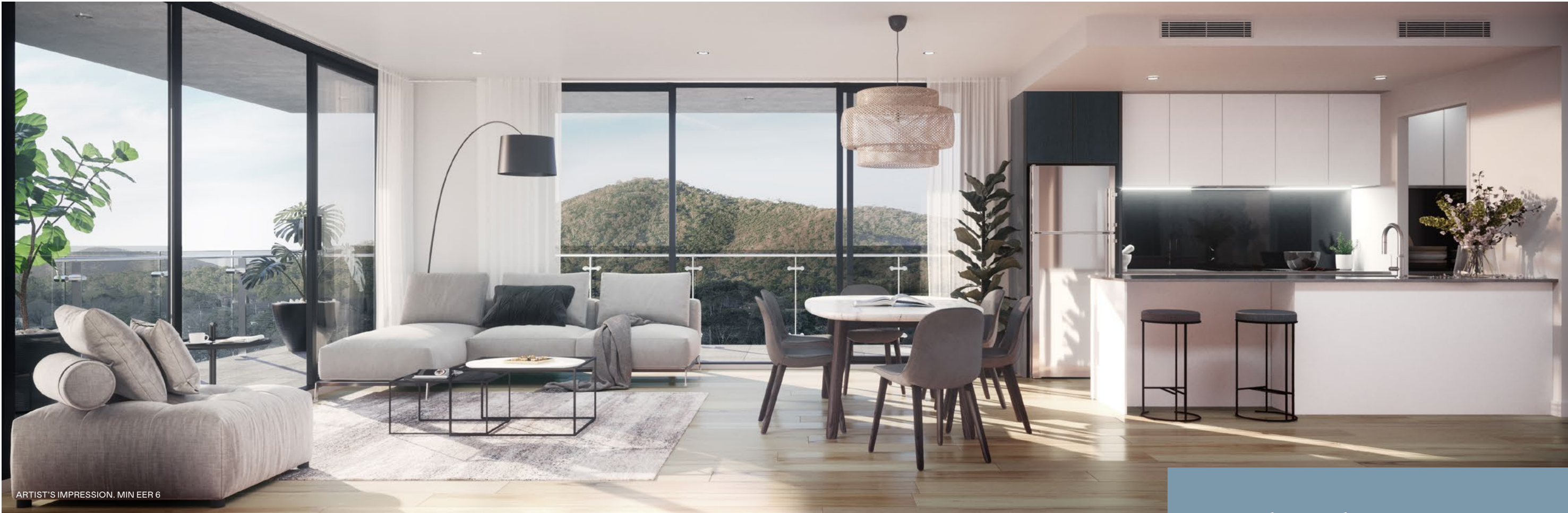
ARTIST'S IMPRESSION. MIN EER 6

Soak in the stunning views of Mt. Ainslie